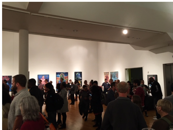
Opening reception at REP 2018 in Austin