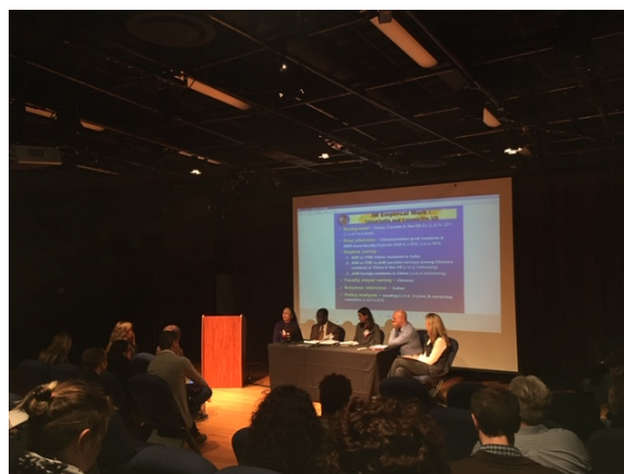
Panel discussion session at REP 2018 in Austin